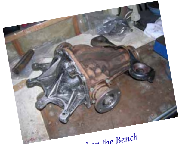
Cleaned on the Bench