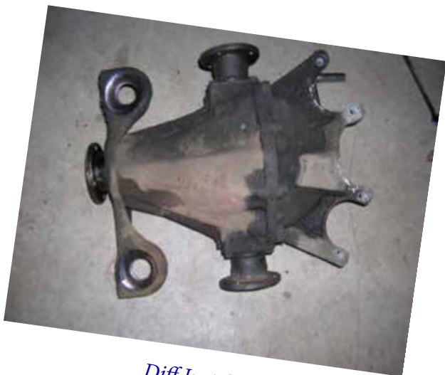
Diff Just Out

Now I need to remove the muffler. Not so easy with the grooves pressed into the pipes by the clamps. Out comes my grinder with cut off wheel, power on and the muffler is cut off just under the drive shaft rear universal joint. A few more bolts and nuts and the muffler and section of the pipes are out I unscrewed both drive flanges and drive shaft, loosened all the bolts, put the diff on a jack and lowered it down - piece of cake. I was very interested to see the mount, specifically the one on passenger side front. Well, someone boxed that one years ago, the metal on the box looked the same as the original mount, I guess this was modified around 1980 when there was some major work done (as per the bills I have in my possession).