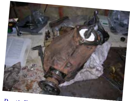
Partially Apart Waiting for Seals

I cleaned all the area around the mounts from grease, made brackets from 11 gauge steel and boxed the remaining three mounts. And since I was all charged up, I also boxed both of the arms steel going down to the frame with 16 gauge. The original design looks pretty weak, the shocks are mounted on these arms (which are made out of 16 gauge metal) with good possibility of twisting these brackets when the load is applied. Like every time the suspension flexes. After I painted my box welding master piece (this was all over head welding, you should see my scars from the welding splatter) I started to work on the differential. First I cleaned it in solvent, removed the bolts and drained the oil. This Triumph is the first car I have ever seen with no drain plug on the diff.