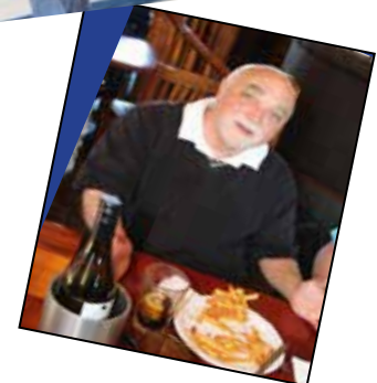
We wonder if he'll ever stop playing with his food!