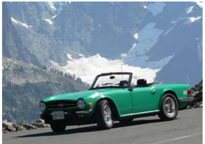
TR6 on Baker Run

The BCTR is a good, strong club but as with anything its strength is in its members. We would like to see more younger people taking an interest in our passion. We would also like to encourage new members to step up and speak up regarding the day to day running of the club. Please don't be shy.