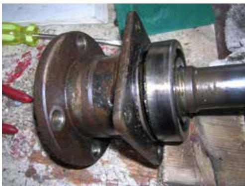
Bearings All Looked Good

On the jack with the diff, up to the car and with a bit of a wiggle, in it goes.