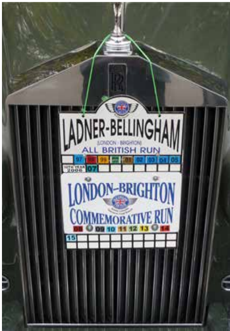
This Rolls Royce has completed all 20 runs!

The 20th edition of the London to Brighton Commemorative Run occurred last Sunday, November 1st. Our run initially was named the Ladner to Bellingham All British Run (London to Brighton), but once crossing the border became problematic, it was renamed to what it is called now, with the routes varying from year to year. Our BC run has traditionally occurred on the same day as the original namesake British run over the last 20 years, which is the first Sunday of November each year.