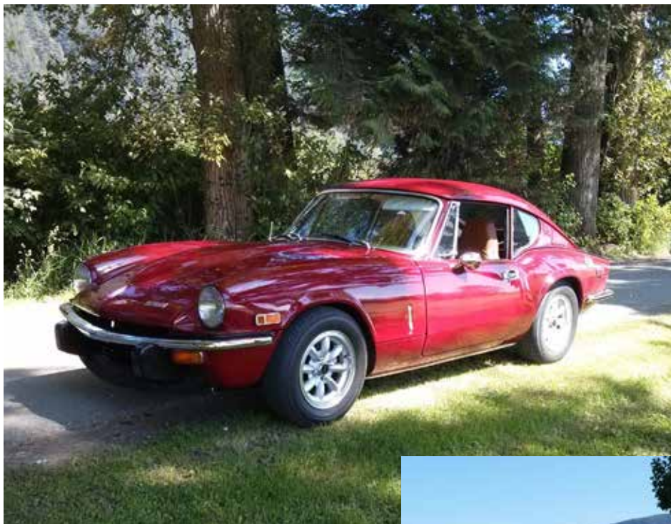
Jerry Goulet's GT 6 and TR3